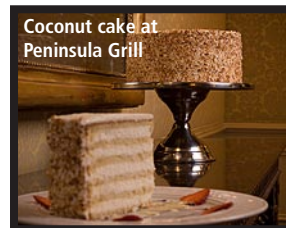
Coconut cake at Peninsula Grill

WINE & FOOD: If you're thinking shrimp and grits is all you'll find in Charleston—think again. Southern specialties get gourmet treatments at Circa 1886 (149 Wentworth Street; circa1886.com ), where the carriage house setting complements the exquisite regional cuisine of chef Marc Collins. Favorites include iron skillet-cooked pork chops with an applejack molasses cure. End the evening with a glass of wine at Bin 152 (152 King Street; bin152.com ), a casual gem hidden among a handful of antique stores that offers 30 wines by the glass (all affordably priced between $7–15), charcuterie and cheese, along with vintage knickknacks.