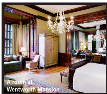
A room at Wentworth Mansion

D on't let the slow Southern drawl of its residents fool you—the historic port city of Charleston has a refined culinary scene that is developing at a rapid pace, making it a hot spot for haute cuisine and winecentric bars.